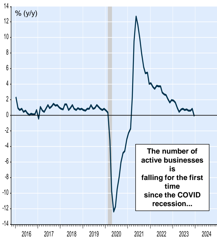
Change in the number of active businesses in Canada